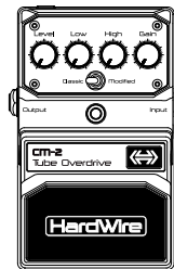
HardWire CM-2 Tube Overdrive Pedal

*Shipping for the CM-2 pedal is $9.95. The CM-2 pedal will be shipped directly from DigiTech, and not supplied by any authorized dealer. RP1000 purchases must be made between June 1, 2009 and September 30, 2009. Entries must be postmarked by October 31, 2009. Check Terms & Conditions for further details.