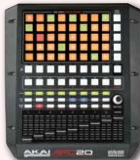
Akai Professional APC20 pg. 156