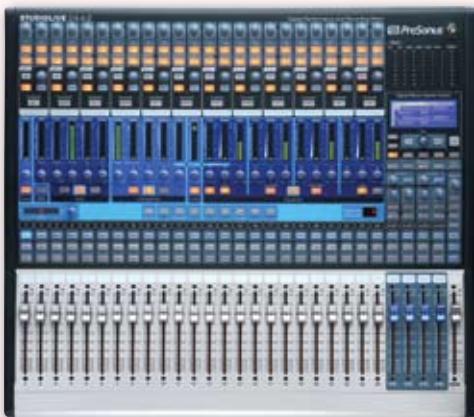
PreSonus StudioLive 24.4.2 pg. 284