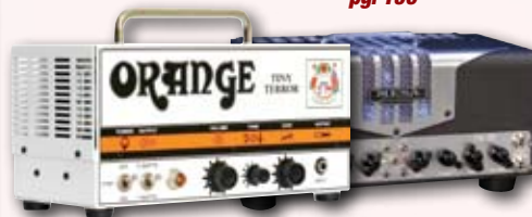
Orange Tiny Terror pg. 67