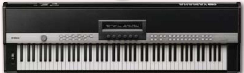
Yamaha CP1 pg. 130