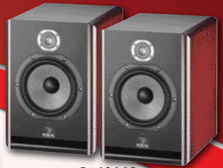
Focal Solo6 Be pg. 416