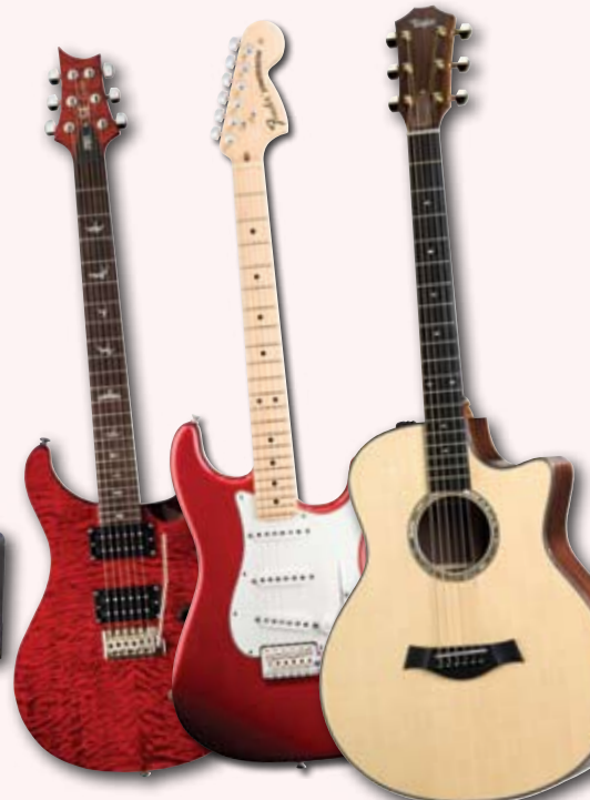
Paul Reed Smith 25th Anniversary SE Custom 24 pg. 27