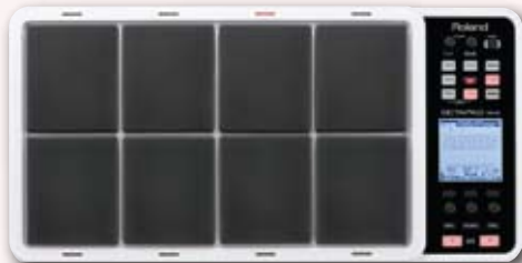
Roland Octapad SPD-30 pg. 184