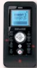
Korg SOS pg. 394