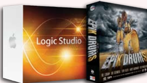
Apple Logic Studio pg. 204